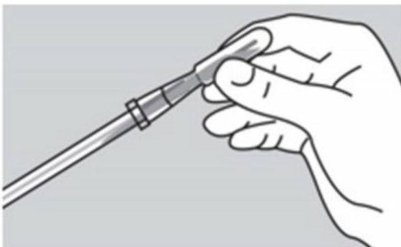
Squeeze the bulb to dispense the broth onto the swab.