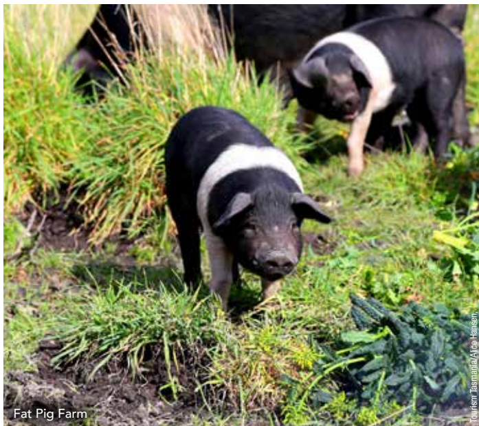
Fat Pig Farm