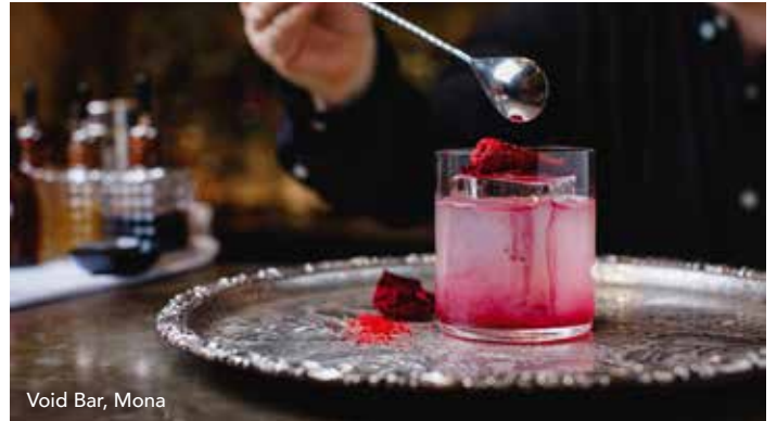
Void Bar, Mona