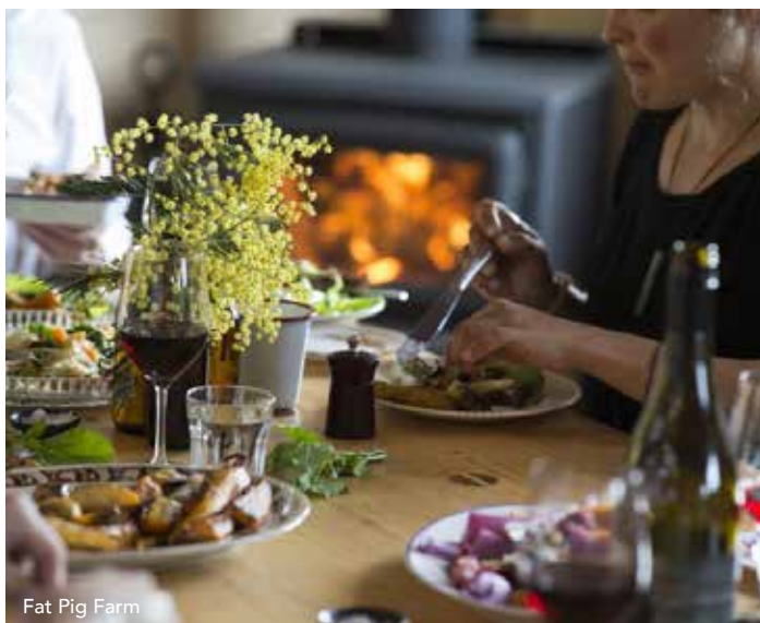
Fat Pig Farm