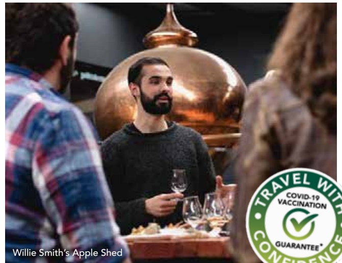
Willie Smith's Apple Shed