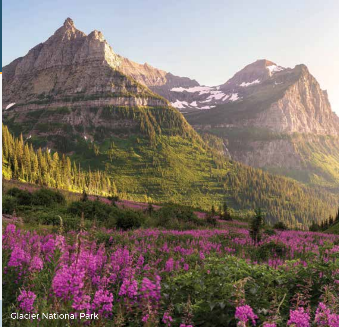
Glacier National Park

Your tour through America's West begins in Chicago, where you board the Empire Builder for the overnight journey west to Montana. Arrive in East Glacier, MT, at the edge of Glacier National Park. A highlight of your stay will be a Red Jammer tour of Glacier National Park. Continue to Helena, where your two-night stay mixes elements of history and nature. Visit the Charles Russell Museum, the Lewis & Clark Interpretive Center, and tour Montana's Capitol. Relax on a cruise through the Gates of the Mountains and enjoy a trip to dinner on a horse-drawn wagon. Then it's time for a three-night stay in Big Sky Country, where you tour Yellowstone National Park, visit Old Faithful, and have a chance to relax on the ranch and take in the quiet scenery, horseback ride and fly fish.