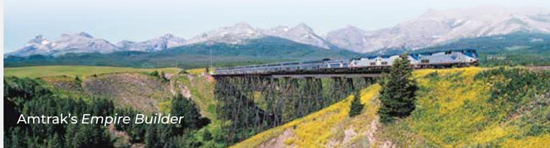
Amtrak's Empire Builder